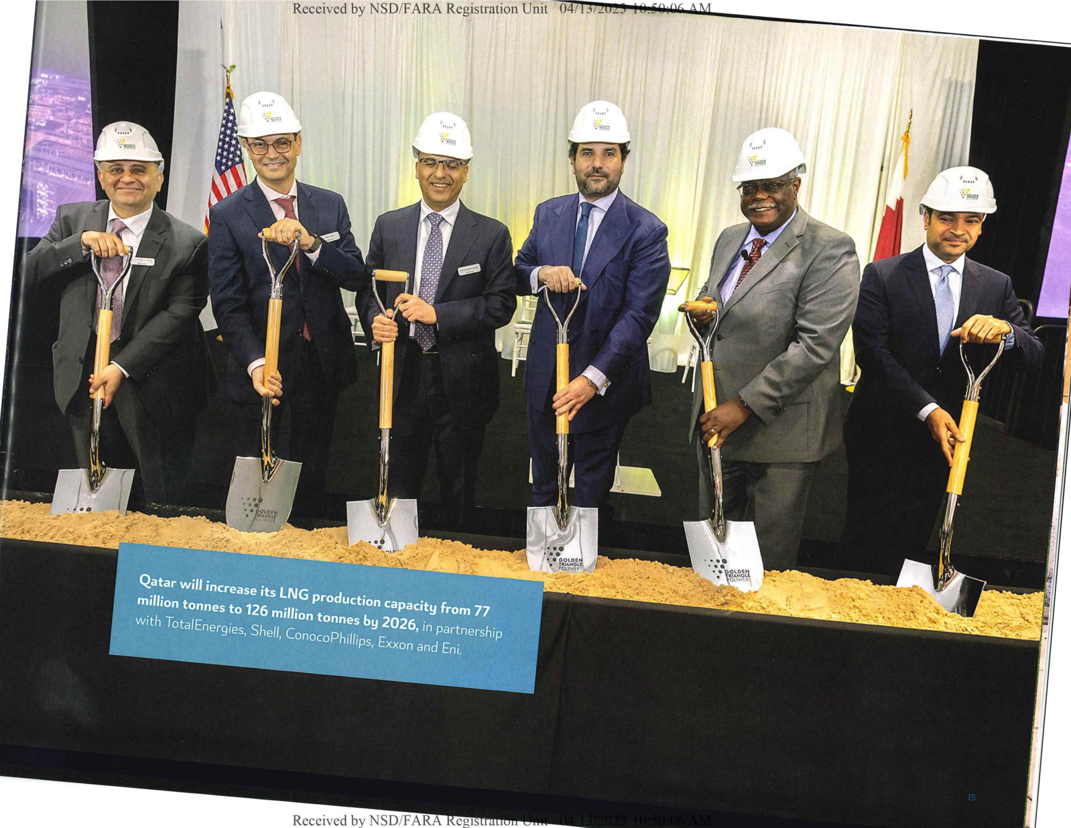
Qatar will increase its LNG production capacity from 77 million tonnes to 126 million tonnes by 2026, in partnership with TotalEnergies, Shell, ConocoPhillips, Exxon and Eni.