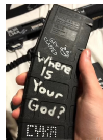
Magazine of Annunciation Catholic School Shooter