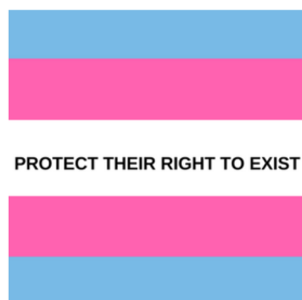
Common TIVE slogan