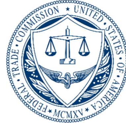
Federal Trade Commission