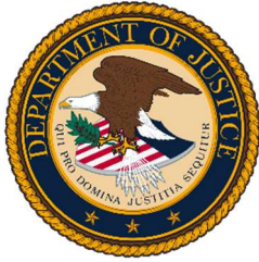
Department of Justice